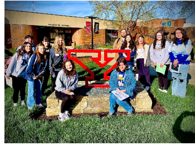
The Villager , April 28, 2023 page 8