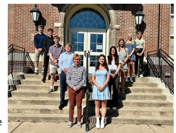
The 2023 Prom Court gathers for a photo.

This year's dance is set to be a blast so make sure to come out and have a good time!